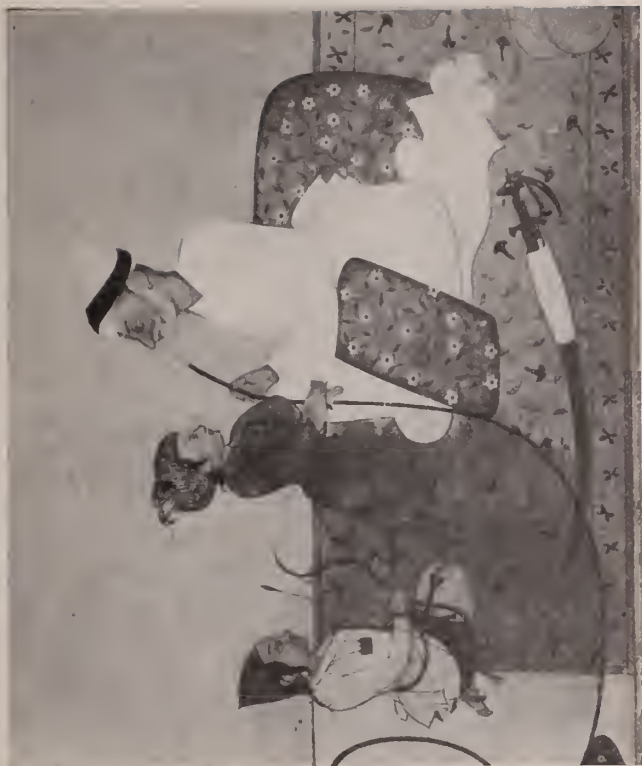
PORTRAIT GROUP, IN THE KANGRA KALM (EIGHTEENTH CENTURY).